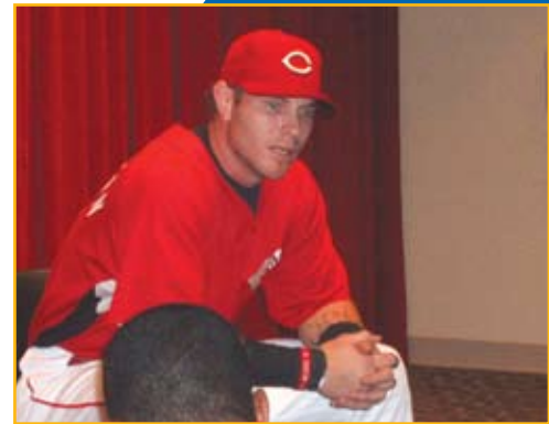
August: Former Cincinnati Reds player Josh Hamilton shares his story of recovery with clients from Alternatives and The Bridge.