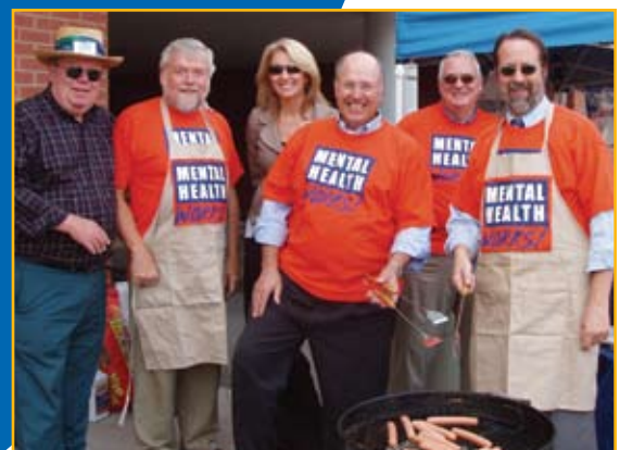
Mental Health Works! volunteers grill at the Mental Health Levy Kick-Off Event.