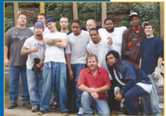
Clients from Men's ADAPT sell holiday trees at Findlay Market to raise funds for Stop AIDS.